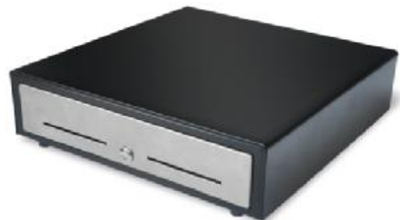
Stainless steel drawer front